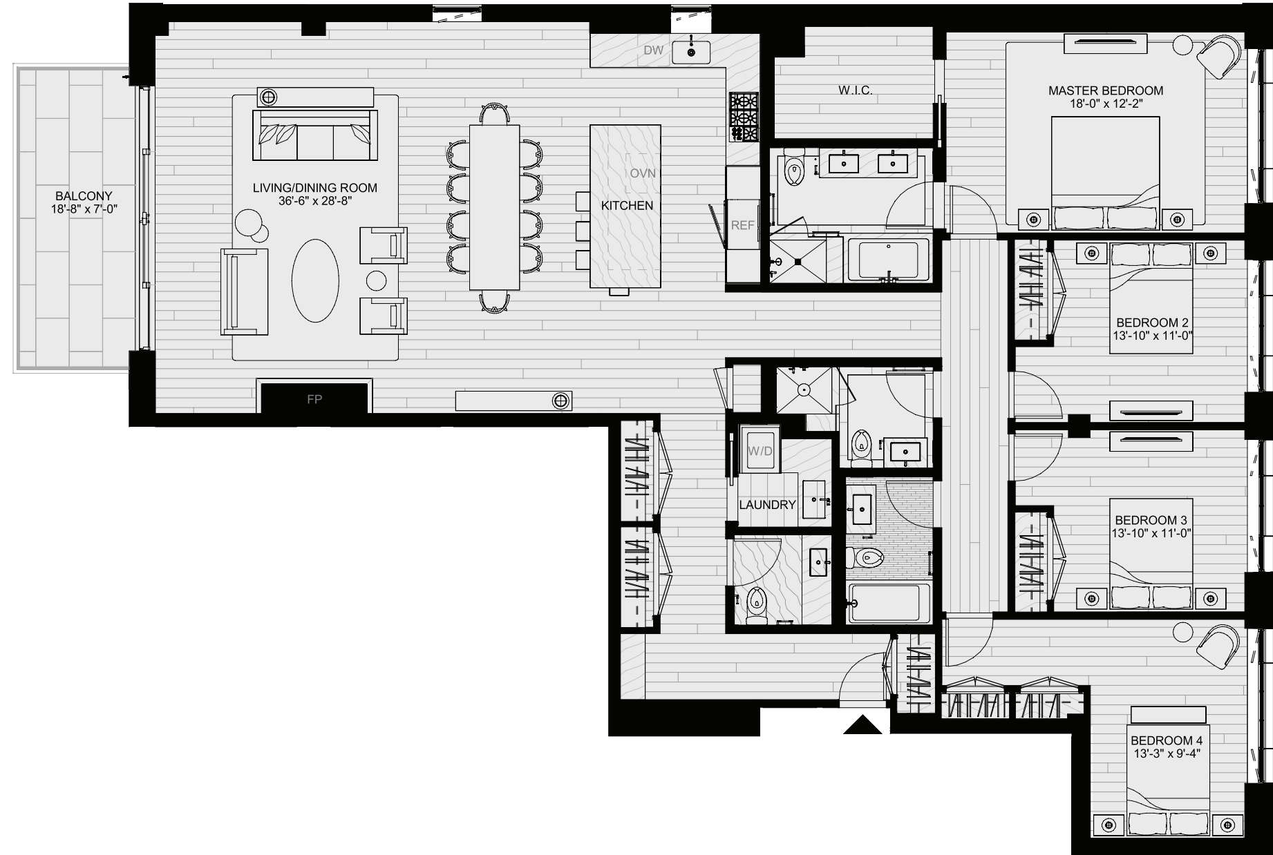
RESIDENCE | 7W