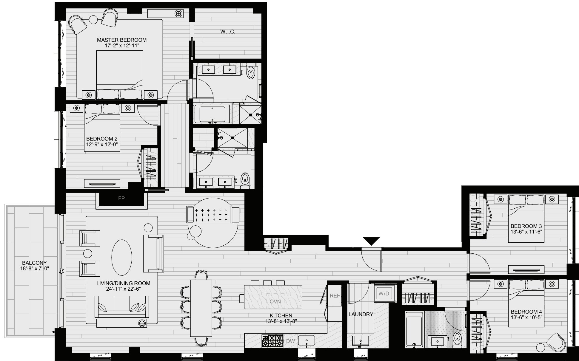
RESIDENCE | 7E