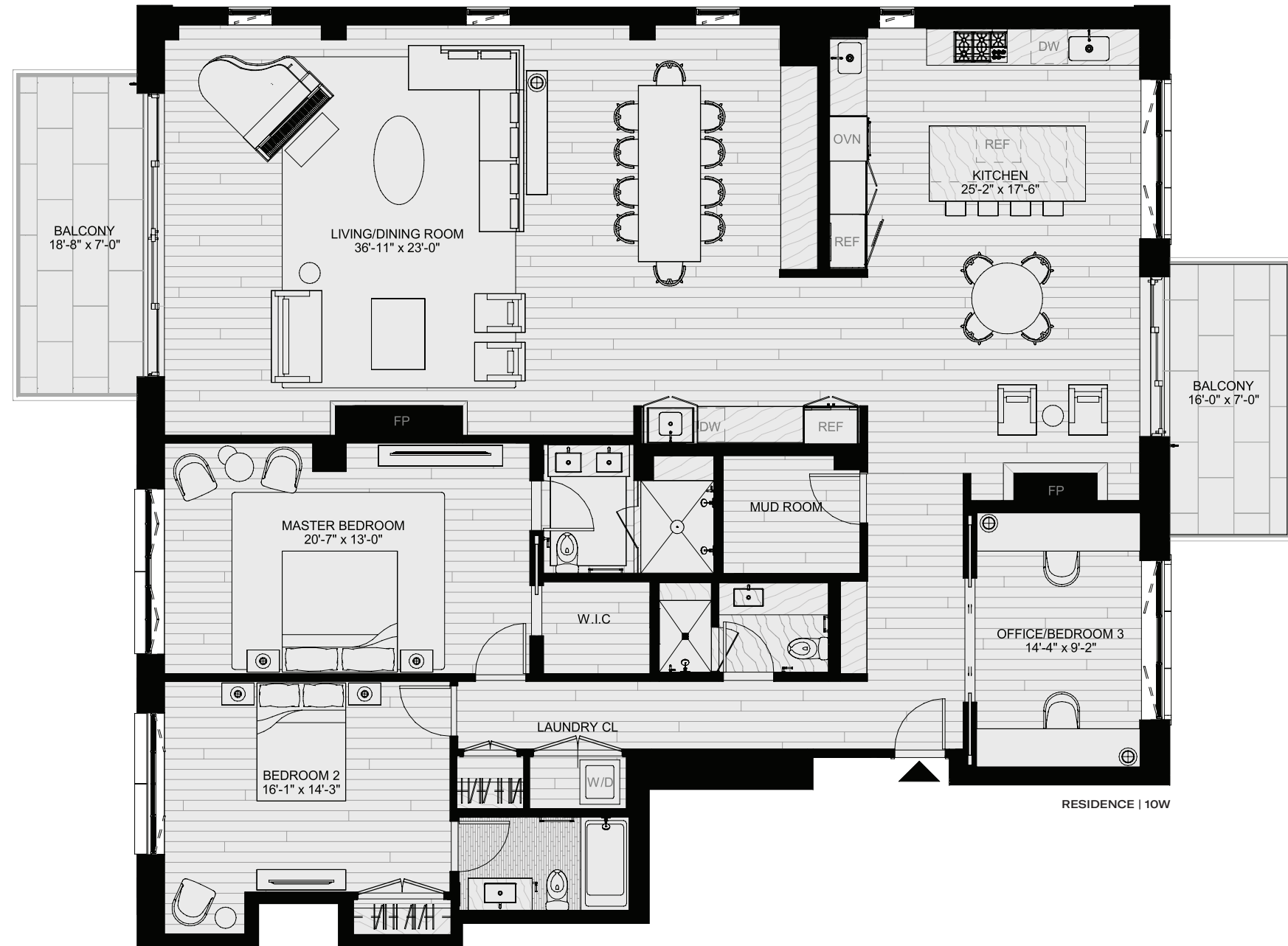
RESIDENCE | 10W